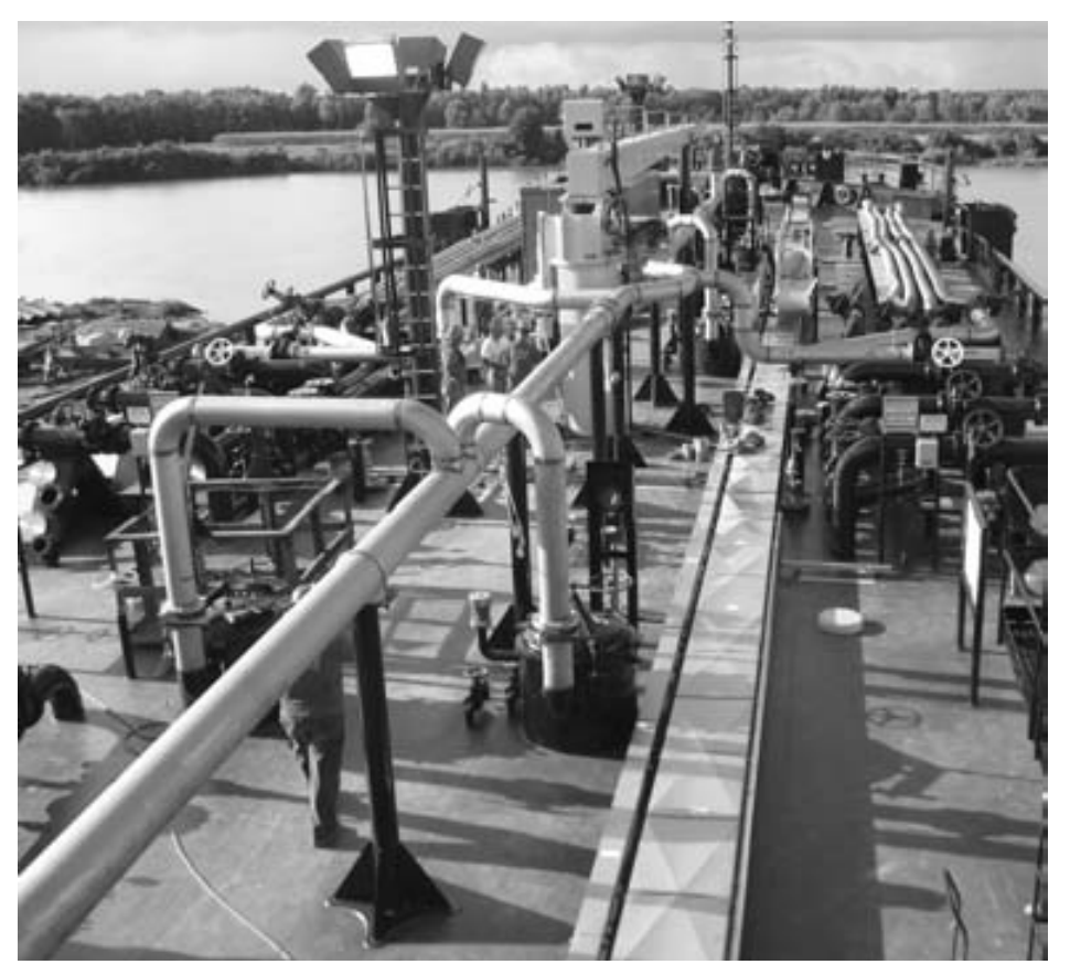
December, 2007 • MarineNews • 21