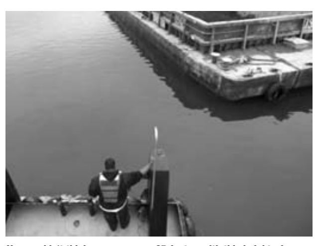
You wouldn't think you were on a 25-footer, with this height-of-eye. The home-made Gabby brings a lot of standard tugboat features, plus high-compliance engines to the job.